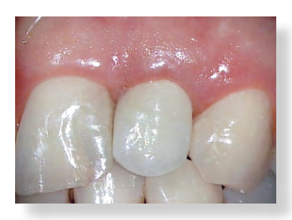
Case 2: Example of a case 2 years following preventive treatment to support the bone using Geistlich Bio-Oss® (Dr. Shakibaie-M., Tehran, Iran)

Geistlich Bio-Oss® and Geistlich Bio-Gide® should be used with special caution in patients with: